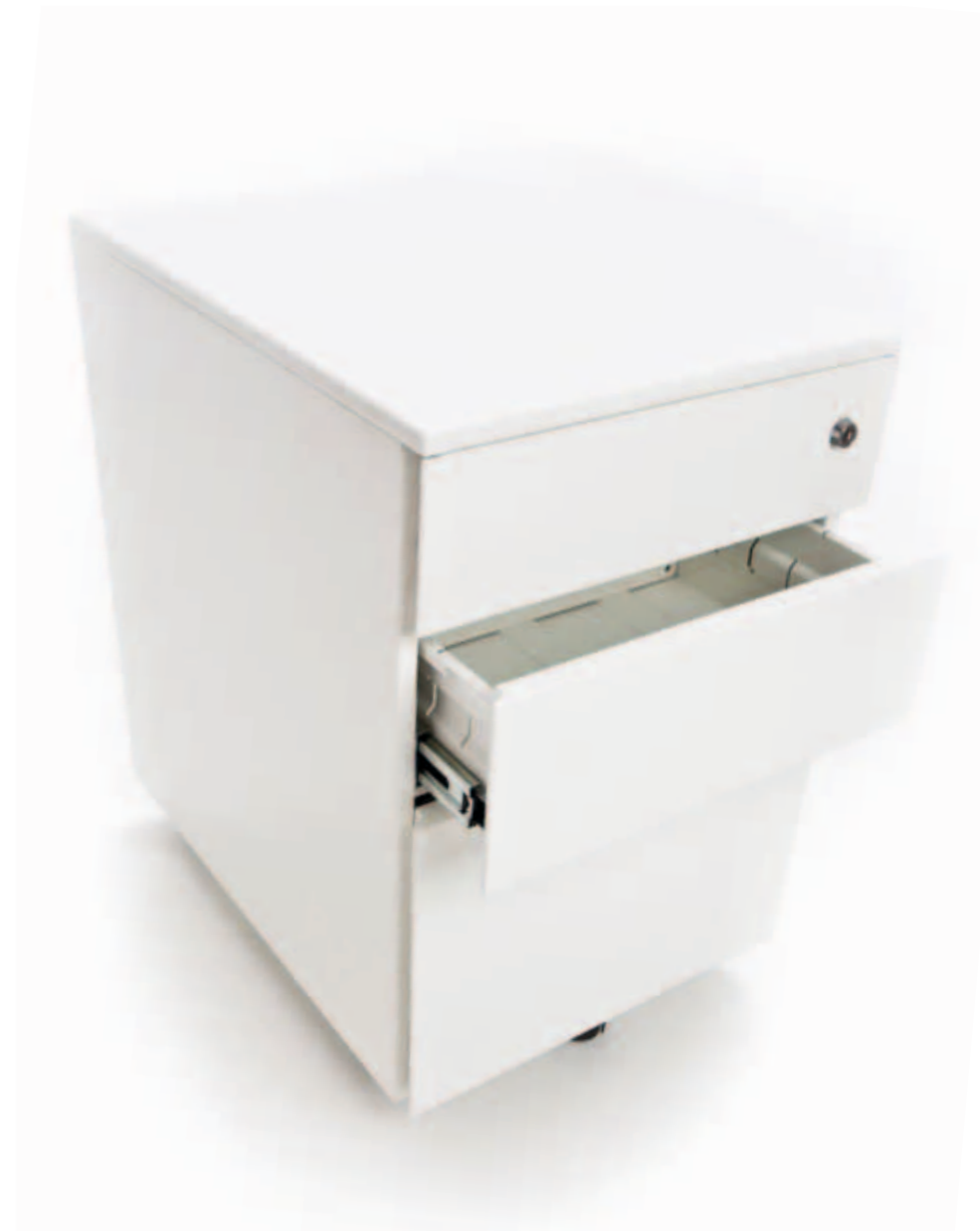
OPPOSITE (Top-Bottom) Linear, Float THIS PAGE (Top) Mobile Caddy, Tambour, Lateral (Right) Mobile Pedestal